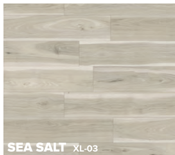
SEA SALT XL-03